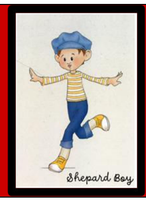
Shep | is a shepherd and the Boy Who Cried Wolf.