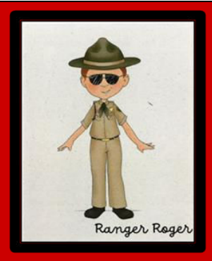
Ranger Roger | is a forest ranger who thinks it is best for The Wolf to be moved from the forest of the play to a new forest called Kallaho.