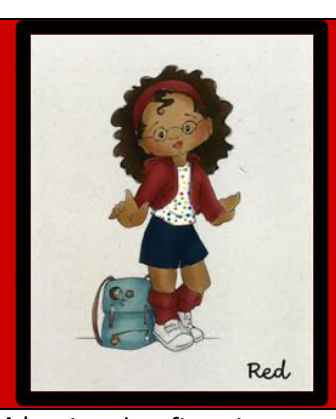
Little Red | enjoys her first-time responsibility of journeying through her beloved forest to her Grandmother's house.