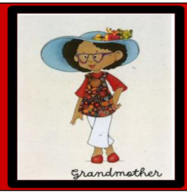
Little Red's Grandmother | is a gardener and treasures Little Red's ability to problem solve.