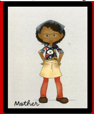
Little Red's Mother | is a gardener and encourages Little Red to take the journey to Grandmother's.