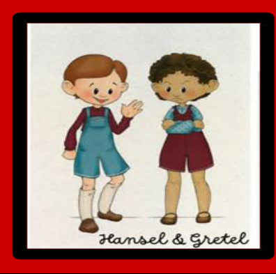
Hansel and Gretel | are brother and sister. Little Red meets Hansel and Gretel on their way home from outsmarting The Witch.