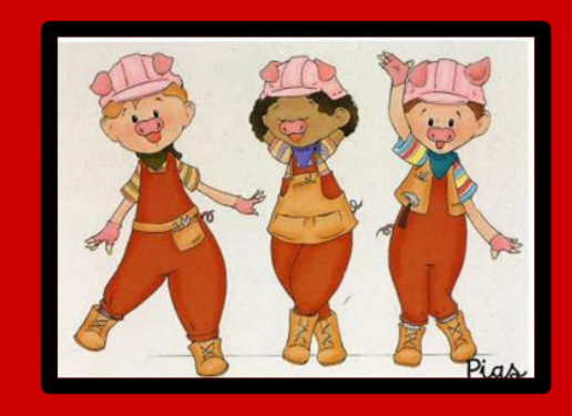
The Three Little Pigs | are siblings who are also construction workers.